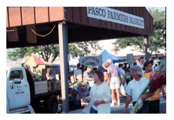
Page 27 of 95 January 2009

San Juan County Economic Development Council Feasibility Study for a Permanent Farmers' Market Prepared by the San Juan Islands Agricultural Guild