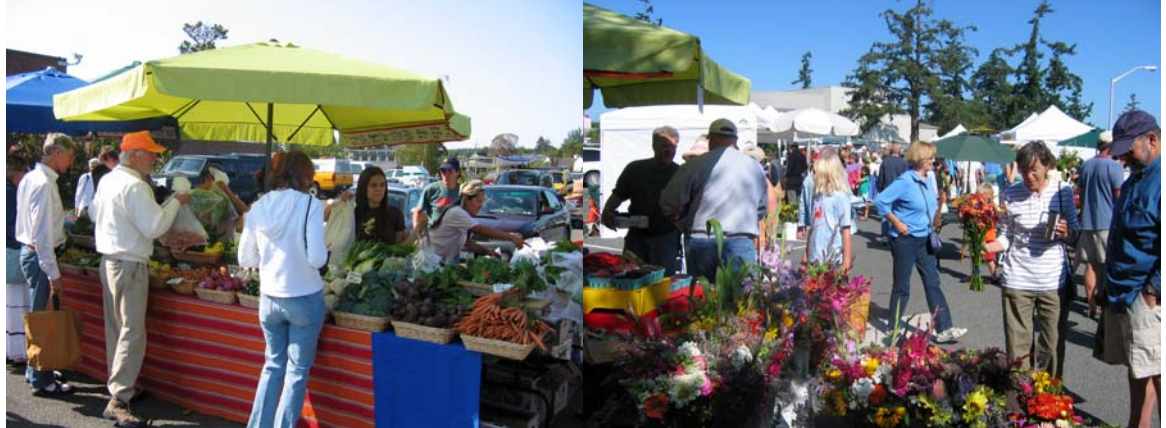
The San Juan Farmers' Market in 2007

In 2002 (the most current USDA Census of Agriculture data available), the total market value of agricultural production in San Juan County was $3.1 million, up from $2.7 million in 1997. That number is expected to rise again in the next USDA census report. There were 225 farms in 2002. Based on community knowledge, this number will also increase at the next reporting, though farm size is decreasing with a 2002 median size of 46 acres (please see appendix ii, "San Juan County Number of Farms and Size of Farms"). Since 2002 there are two newly certified Grade A dairies, and the number of farms/farm vendors at the San Juan Farmers' Market (located in Friday Harbor) has increased from 19 to 28. In addition, the reported gross annual sales of the San Juan Farmers' Market increased over 55% from $156,653 in 2006 to $244,044 in 2007. San Juan County has a total population of 15,500 (with 6,822 on San Juan Island) and three farmers' markets.