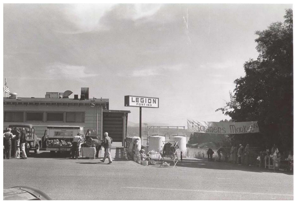
San Juan Farmers' Market in the early 1980s at its first location in front of the American Legion

San Juan County is experiencing rapidly changing demographics to a wealthier, retirement aged populace, and San Juan County farmers' are facing rising land costs and impinging development. Residents and visitors are simultaneously becoming more aware of the value of San Juan County's pastoral landscape and the value of local food production to community food security, environmental stewardship, and quality of life and health issues.